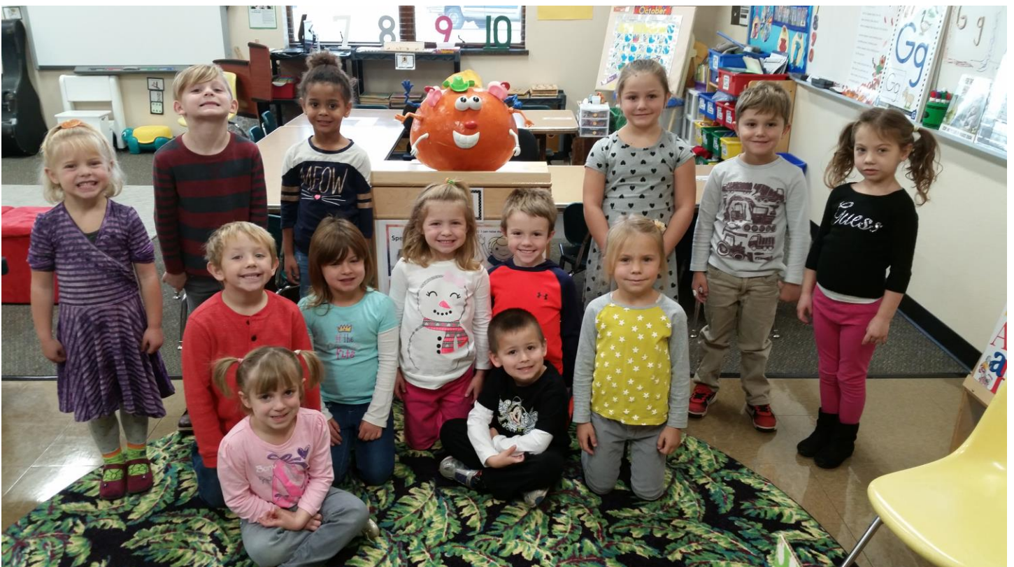
Below: we are posing with our classroom 'pumpkin head'. Each student added a piece to the project. We were proud of it!