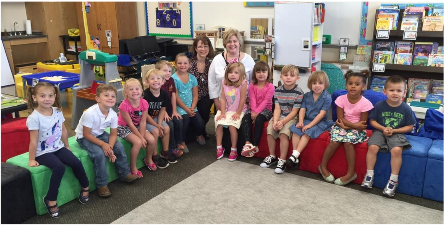
Above: class picture taken earlier in the year...