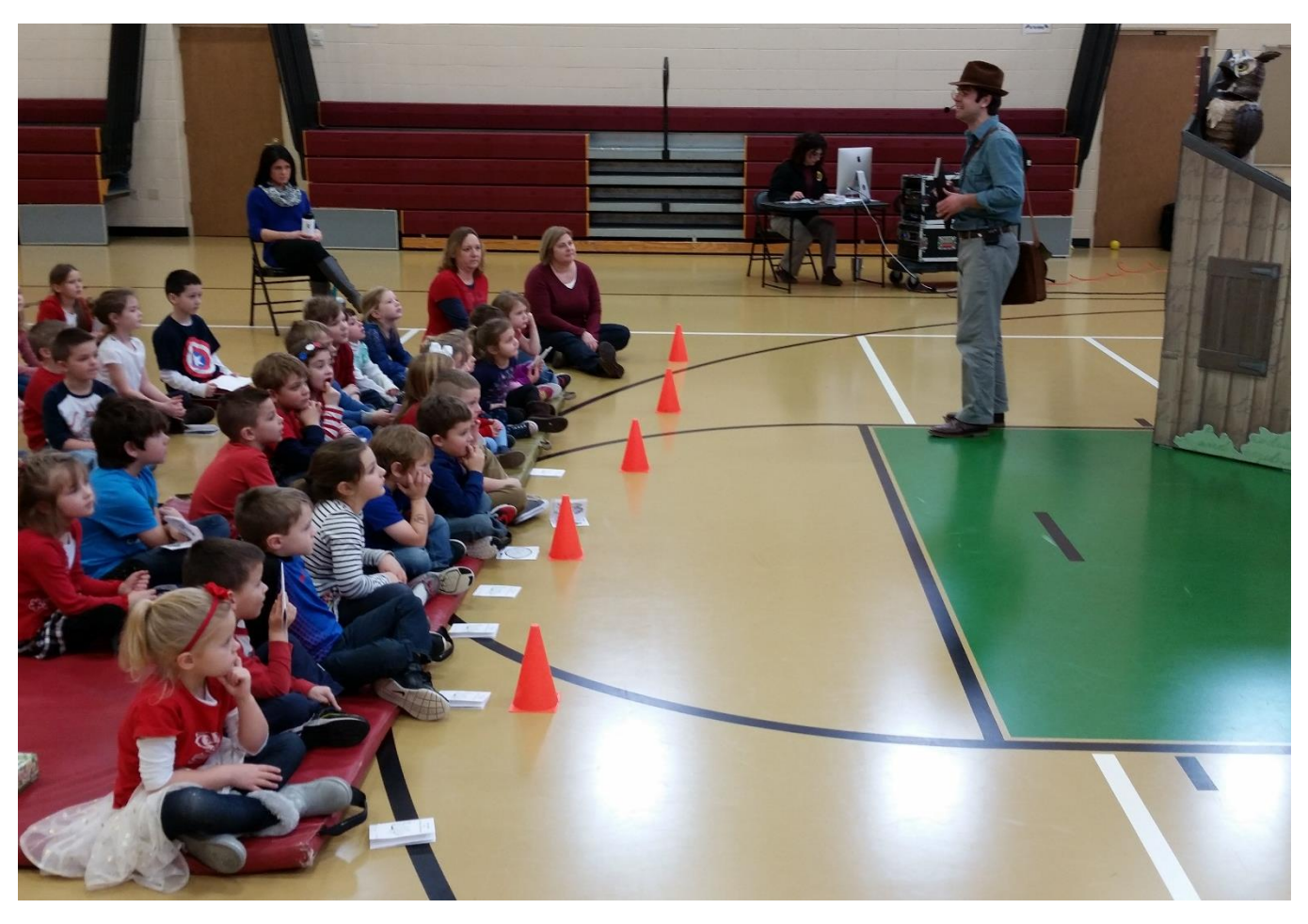
Kohl's Wild Theatre, notice upper right corner, they featured an owl!