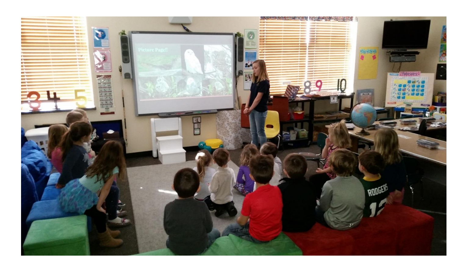
One of our 5<sup>th</sup> graders teaches the children about Barred Owls.

Some of our 4K students are modeling an infant baptism.