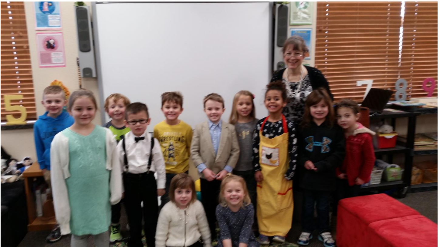
(above) We dressed up as 100 years old to celebrate over 100 days of school!