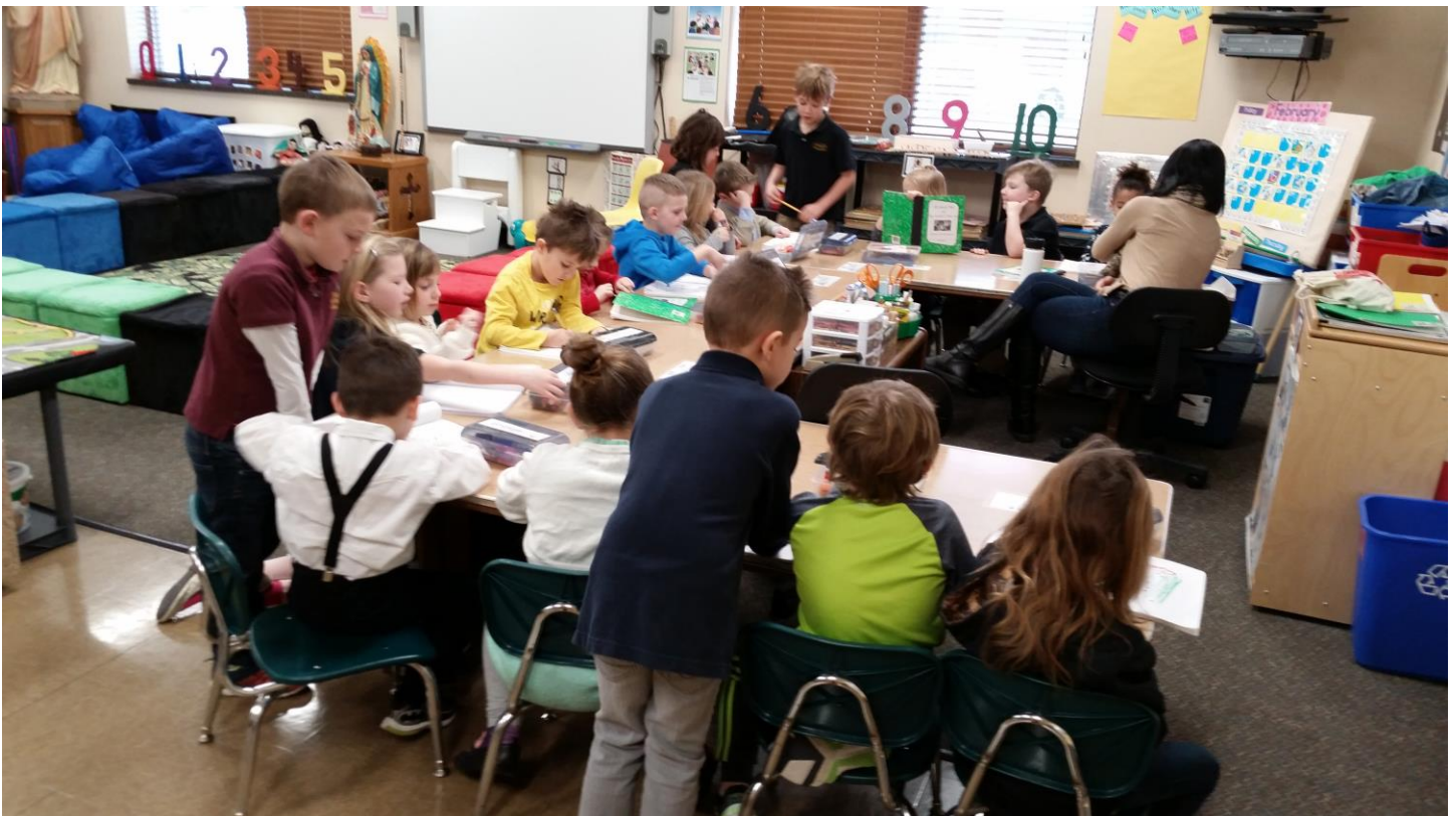
(below) K5 came to help mentor us to draw 100 of something in our journals.