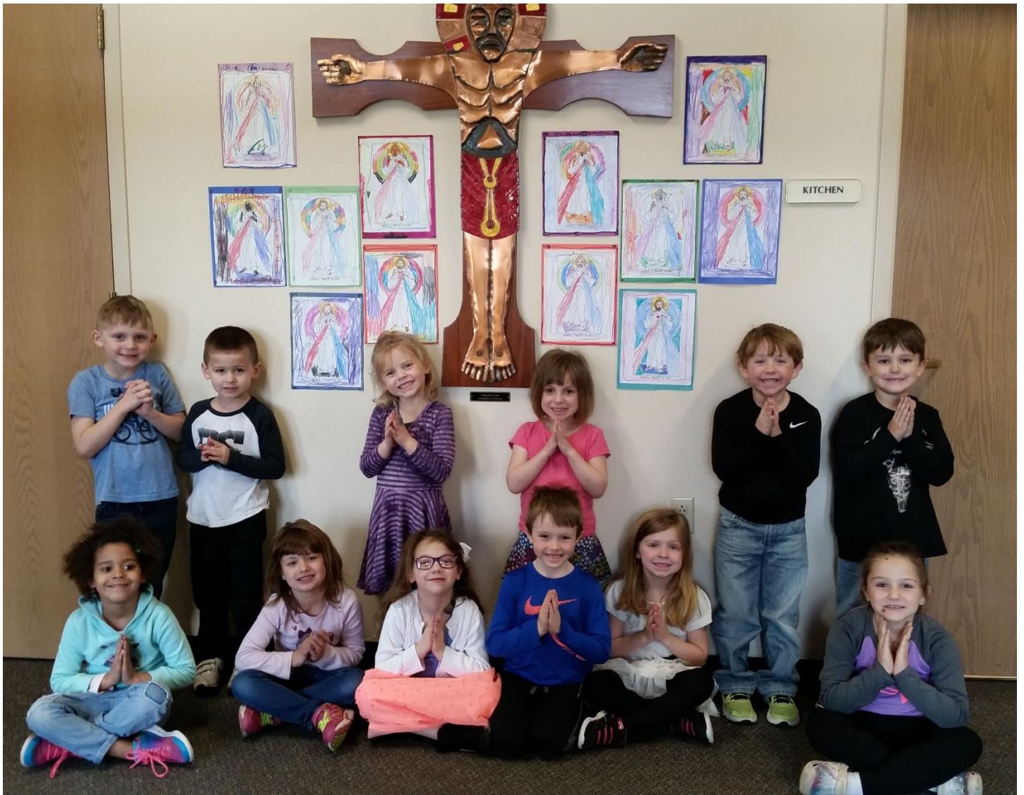
All ready to celebrate Divine Mercy Sunday ... Jesus I trust in You!