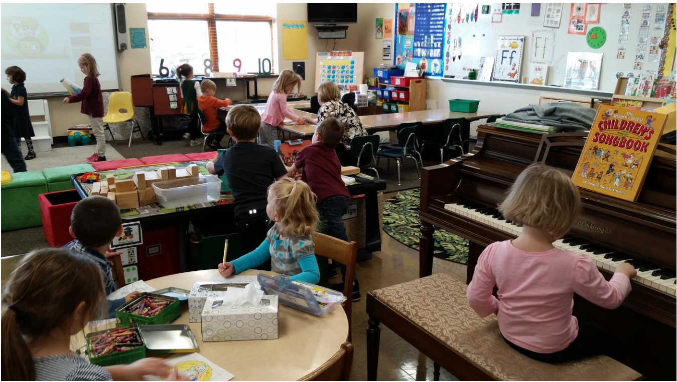
Enjoying some free choice play with our K5 friends and playing our new piano!